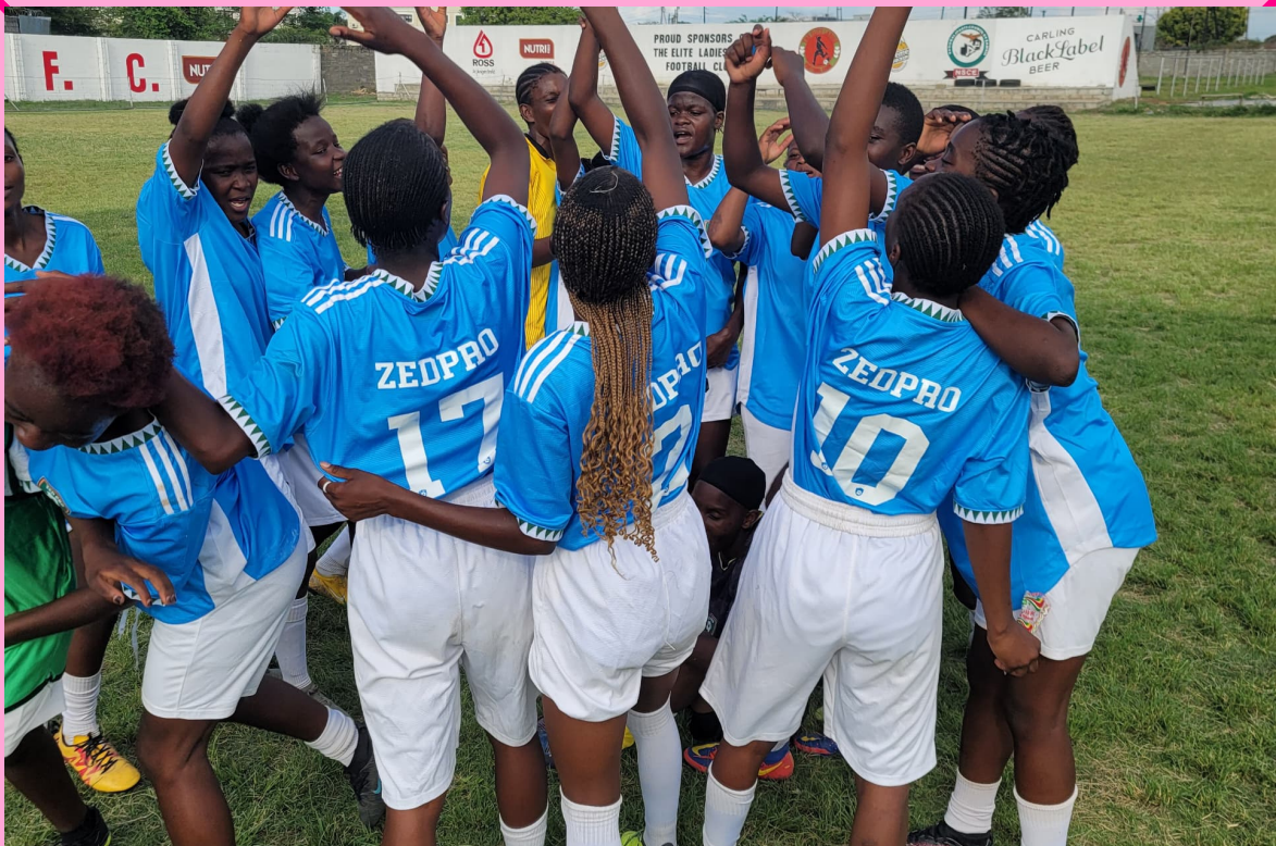
Our girls jubilating a win

At ZedPro Sports Foundation, we envision a future where young girls can develop their soccer skills and become confident, successful athletes who excel in all aspects of life. We strive to create an environment that fosters their growth as individuals and empowers them to overcome challenges and reach their full potential.